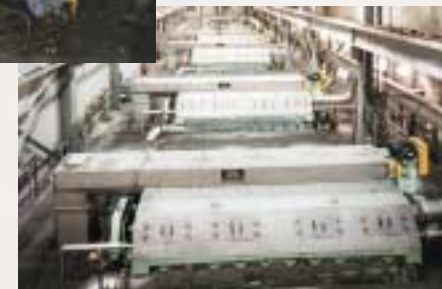
Improved Brown Stock Washing