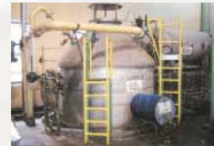
Elemental Chlorine Free Bleaching