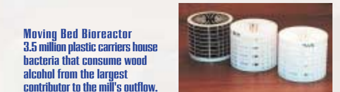
Moving Bed Bioreactor 3.5 million plastic carriers house bacteria that consume wood alcohol from the largest contributor to the mill's outflow.