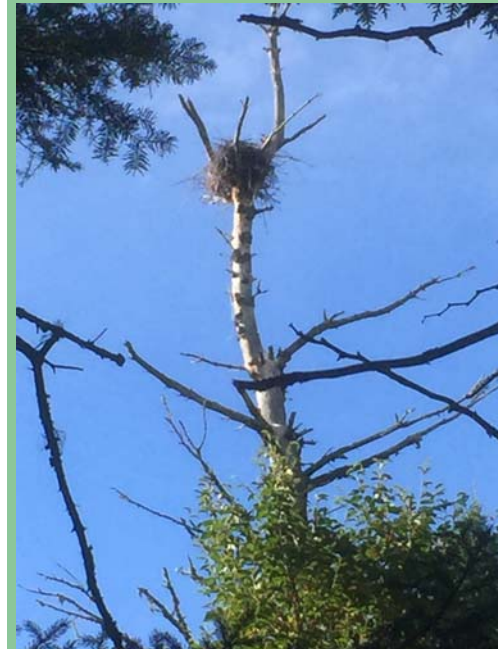
The above is an example of a Heron nest that was identified during layout and then buffered and operational timing restrictions enacted to protect and prevent disturbance of the nest and birds (Maine).