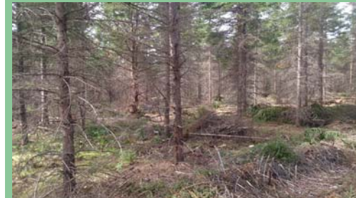
JDI makes use of varied silvicultural prescriptions to meet its fiber flow needs and the ecological objectives for the sites (this picture of a commercial thinning block was taken in Doaktown, NB).