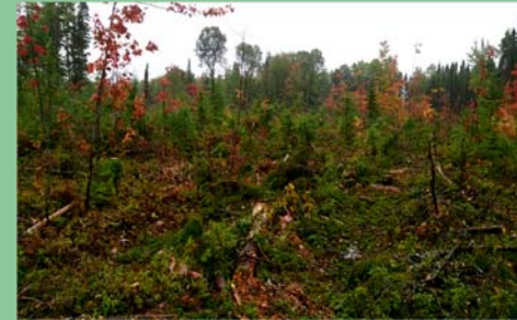
Where operationally feasible and silviculturally appropriate, JDI maintains advanced regeneration during harvesting, such as in this picture where young spruce were effectively retained during operations (Chipman).