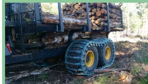
JDI has conducted research on the impacts of machine configurations on rutting and soil compaction. Because they distribute weight, tracks are being increasingly used to limit soil disturbance (picture taken in Doaktown, NB).