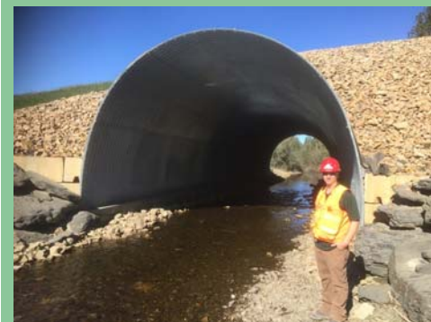
JDI conducts drainage area calculations for all of its crossings to ensure that culverts and other crossings are of sufficient scale to accommodate large rain events (Black Brook).