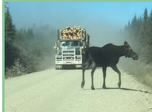
JDI enforces strict safety guidelines for the truckers it employs. Seen above is a logging truck decelerating to avoid a moose in the Black Brook area.

As no major nonconformities were identified during the audit, the audit team recommended that JDI be certified to the 2015-2019 versions of the SFI Forest Management and Fiber Sourcing standards. JDI's SFI Forest Management and Fiber Sourcing certificates are valid to October 27, 2018.